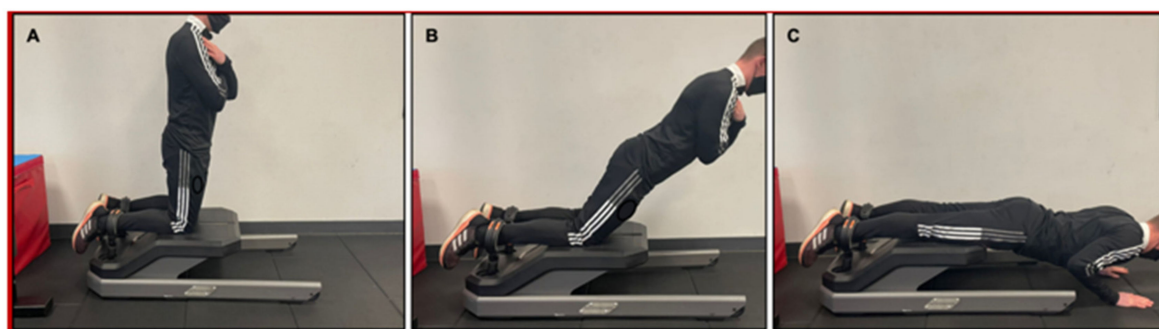
Figure 1. Performing the Nordic Hamstring Exercise on NordBord. (A) Starting in upright position, (B) contracting knee flexors during movement to control descent, (C) finishing by placing hands on the ground after breaking point; all while ankles are secured. Scan QR Code for video of NHE.

The protocol of the NHE involved the player placing their heels under the hooks with their knees placed on the NordBord. Their knee position was recorded in the software for consistency during every repetition each time the exercise was performed. For the starting position, the player’s knees began at 90^\circ . Once in position, the player was then required to lower their torso in a controlled manner over a minimum of three seconds, until they could no longer hold the movement. During this movement, the players were encouraged to keep their shoulders, hips and knees in line through verbal cues given by the practitioner so that neutral hip alignment was maintained. They would then catch themselves at the end of the movement by placing their hands on the floor, walk their hands back in and, when ready, repeat to complete three repetitions (Figure 1). The players were allowed a maximum of three minutes to complete all three repetitions, with most players requiring less than one minute.